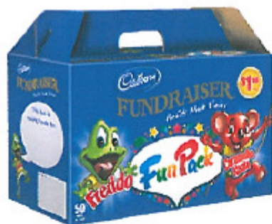
Freddo & Friends Fun Pack