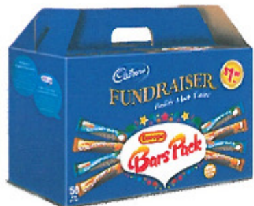
Summer Rolls & Honey Logs