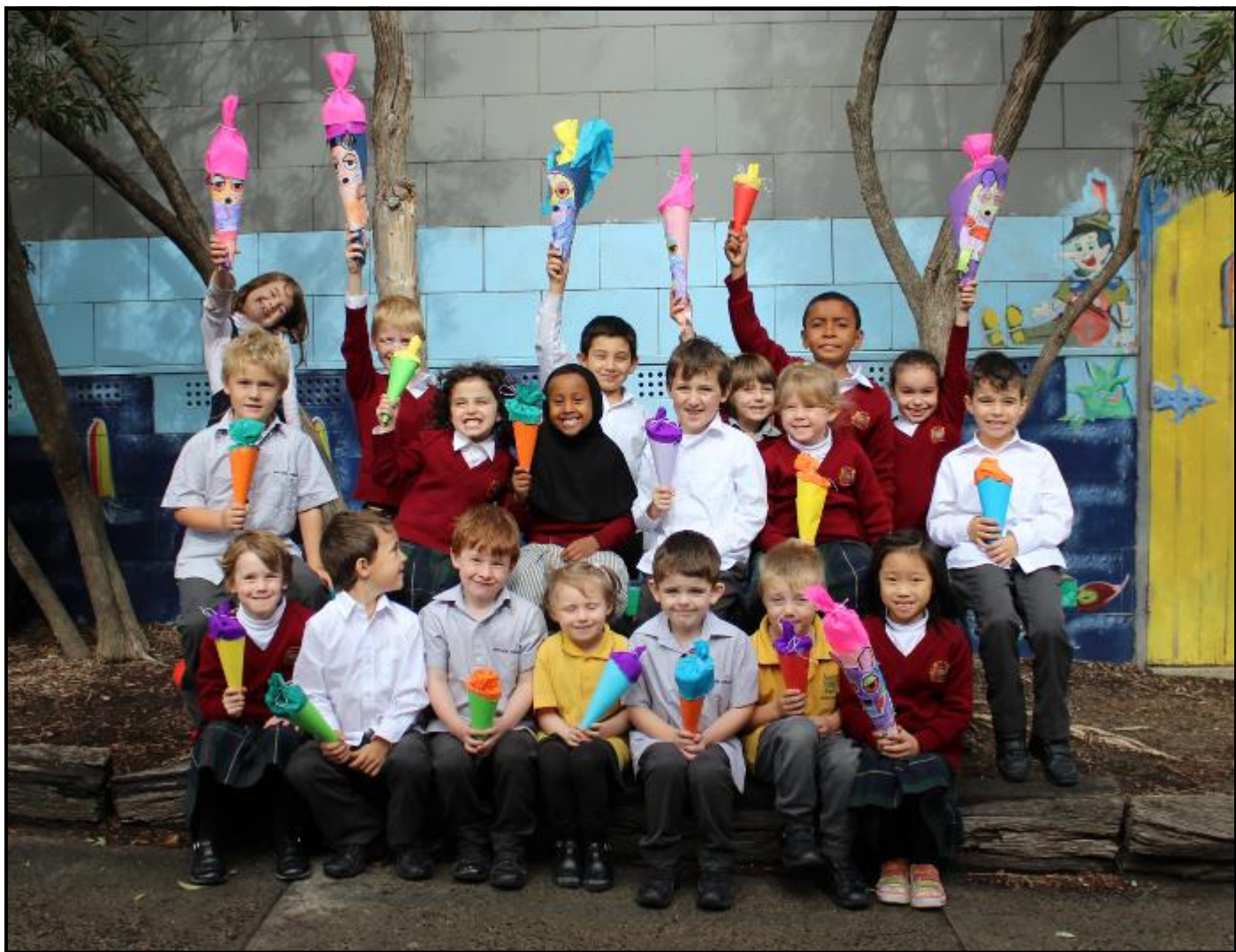
Prep - 2 Students with their German Shultute Schoolcones