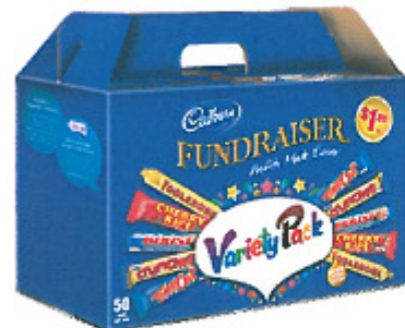
Cadbury Variety Pack