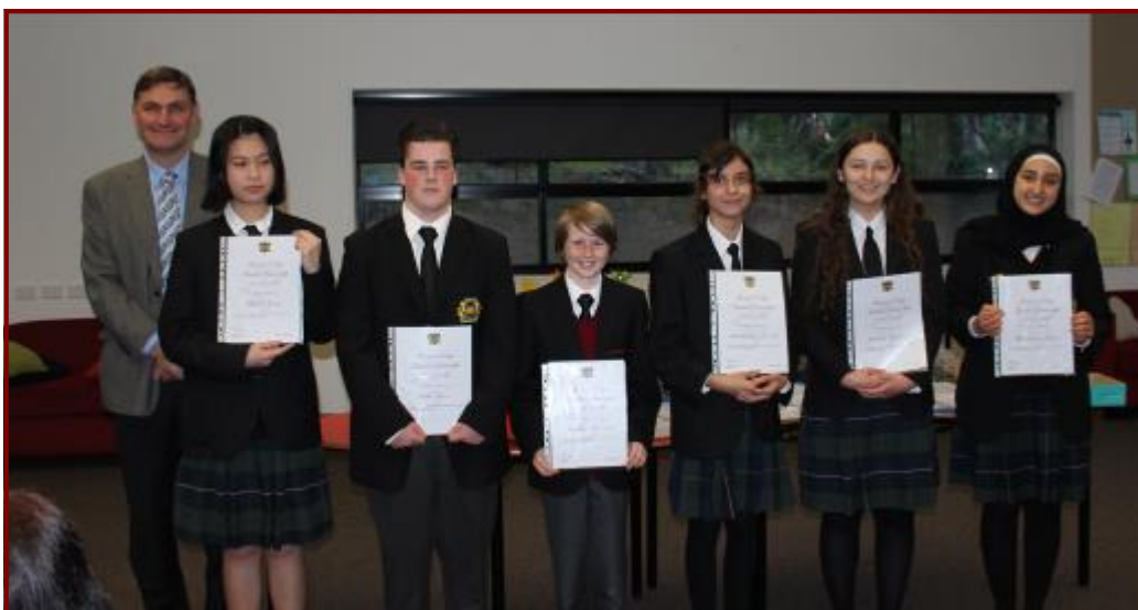
2017 College Captains & Deputies

MONDAY 5 th DECEMBER 2017 STAFF PLANNING DAY PUPIL FREE - OSHC AVAILABLE