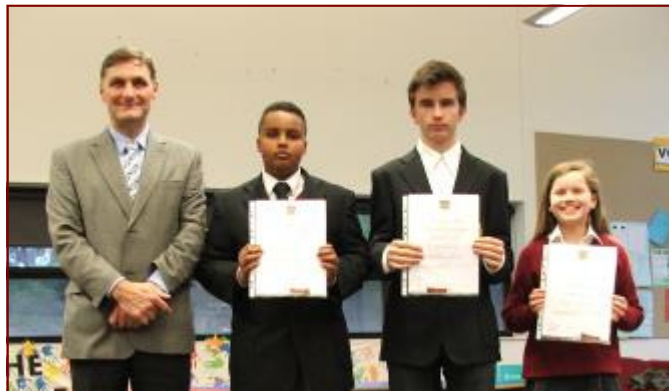
Ramsay House Captains & Primary Leader