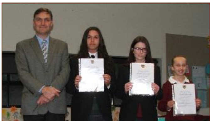
Scarff House Captains & Primary Leader