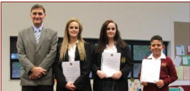
Shepherd House Captains & Primary Leader