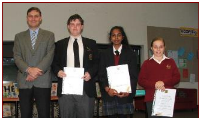
Carter House Captains & Primary Leader