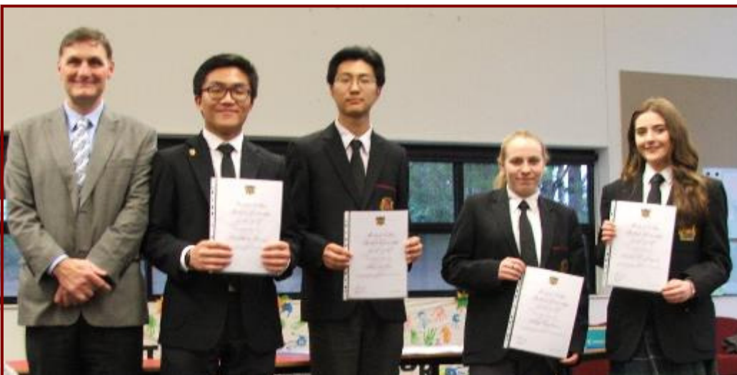
2017 Music Captains & Deputies