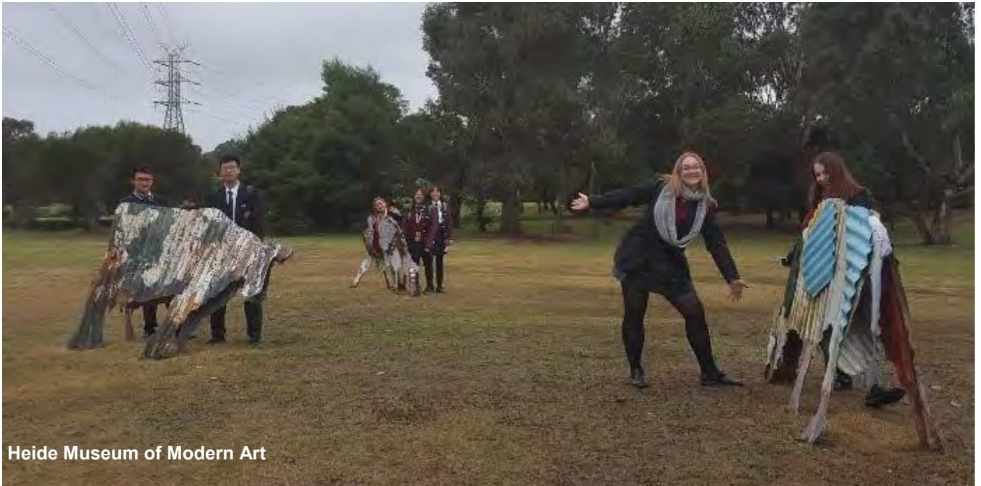
Heide Museum of Modern Art