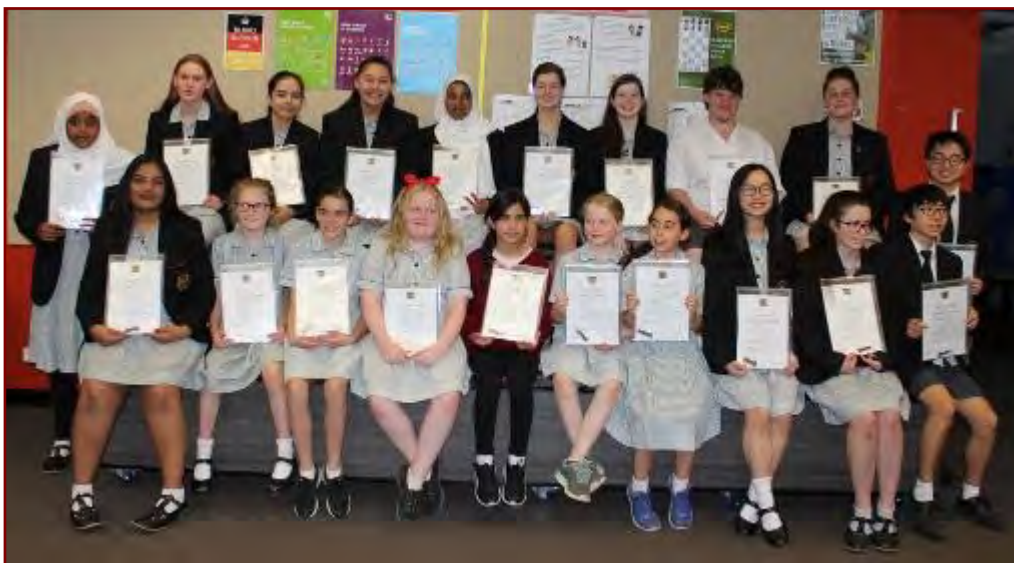
2018/2019 Leadership Inauguration Monday 12 th November

Please advise the College by phone 9459 0222 or email macleod.co@edumail.vic.gov.au if your child(ren) will not be returning to Macleod College in 2019.