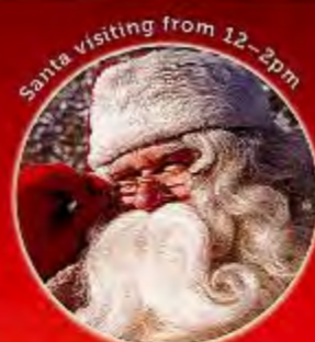
Santa visiting from 12-2pm