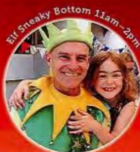
Elf Sneaky Bottom 11am-2pm

REPORT TO CLUBHOUSE 15 MINUTES BEFORE SESSION START