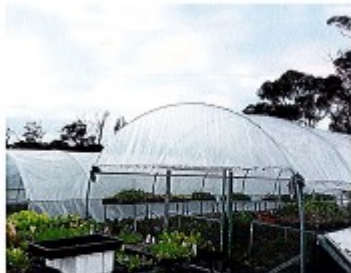
Poly Tunnels in the garden.

have been dug outside the front fence and planted with tansy and calendula, and the oval fence has been weeded and mulched. We have mown a wide strip around our garden and the community garden to prevent weed going to seed.