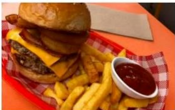
Fresh As Café