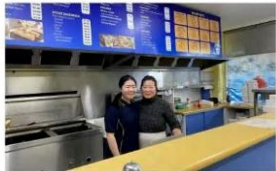
Stevie's Fish and Chips