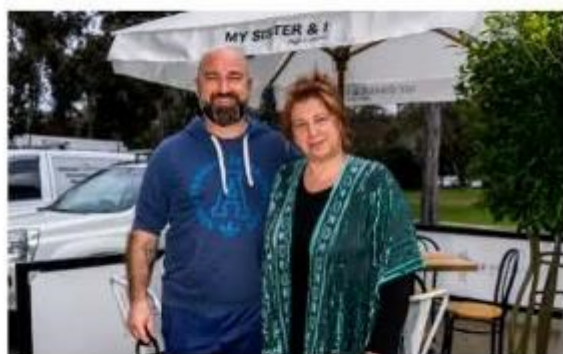
My Sister and I Caffee Cucina