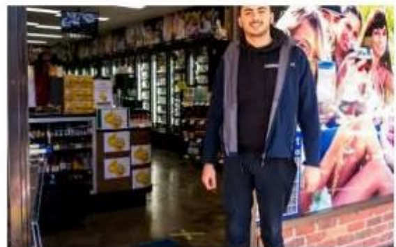
Bottlemart Macleod Cellars